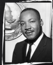
Dr. Martin Luther King Jr.